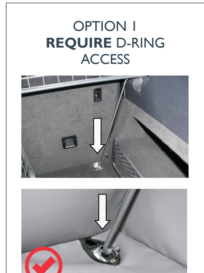
SLOT IN BOOT-LINER ALLOWS ACCESS TO D-RING

2 optional bound holes can be added to provide access to the 2 "D" rings behind the rear seat. These allow the use of the dog guard Please use this guide to decide if require the