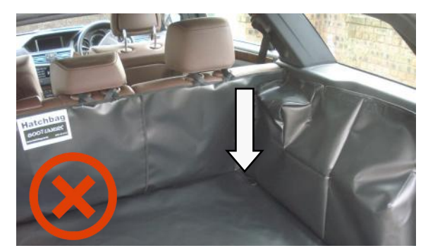
NO SLOT IN BOOT-LINER, COVERING THE D-RING